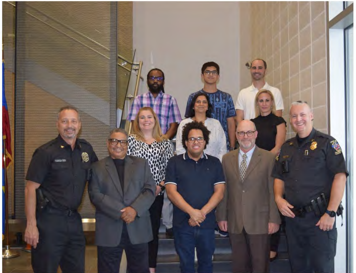
Graduates of Citizen Academy Session 73