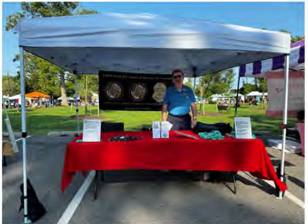
Promoting Academy at local markets