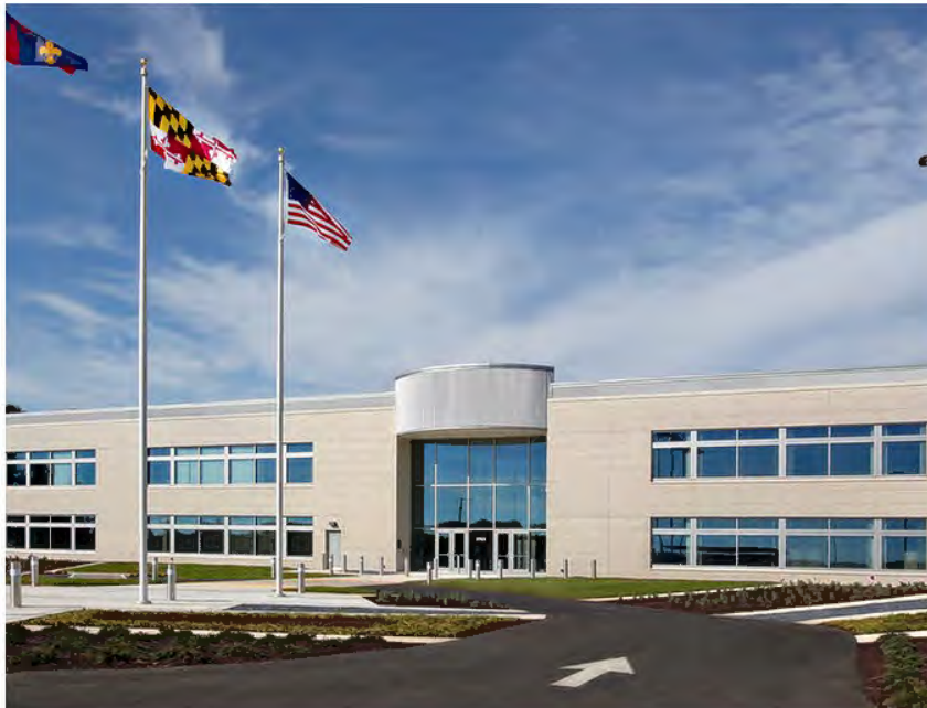
Public Safety Training Academy Front Entrance

The Police Academy is housed on the 1st Floor of the main academic building and consists of administrative areas for staff, 9 classrooms (1 designated stadium style seating for up to 60 recruits, 1 - 20-person computer lab, 1 designated for instructional firearms) for annual in-service, first aid, taser and other specialized training. There is also a firearms simulator for shoot-don't-shoot scenarios, indoor fixed position and tactical firing ranges, defense tactics room, gymnasium, weight room, separate staff and recruit locker rooms for males and females (each locker room also has its own washer and dryer) and a multi-purpose room where recruits eat lunch, have morning inspections and can be used by the community at no charge.